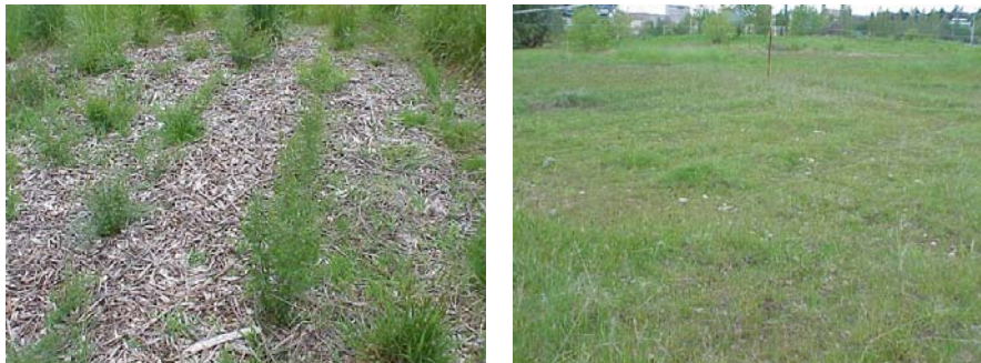
Figure 1: Typical mulched (left) and herbicide-treated (right) plots one year after installation; note the rows of mulched snowberry on the left, obscured by weeds on the right

Each spring, the plants are analyzed to determine their survival and growth rates; this monitoring will continue for five years. The first analysis occurred in April 2001, when plants were counted and survival percentages for each species and treatment were determined. The height of each plant, from the root crown to the tip of the stem, was then measured. The relative success of the test plants and weedy invaders was also noted. Our data were analyzed using single factor analysis of variance (ANOVA).